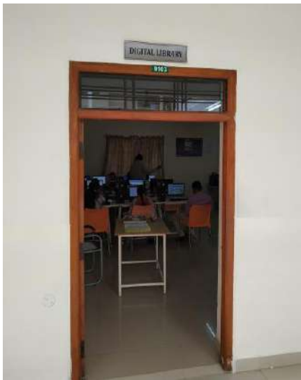
Digital Library Entrance