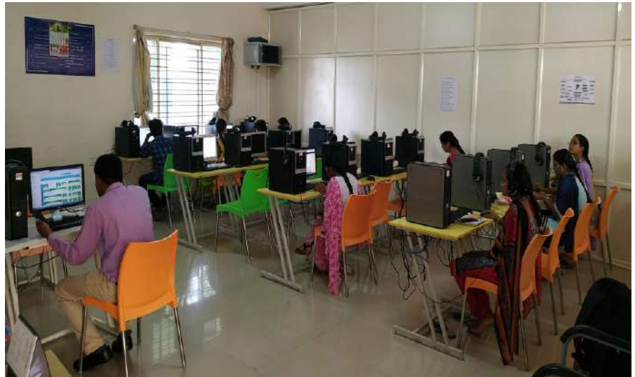
Digital Library Inner View