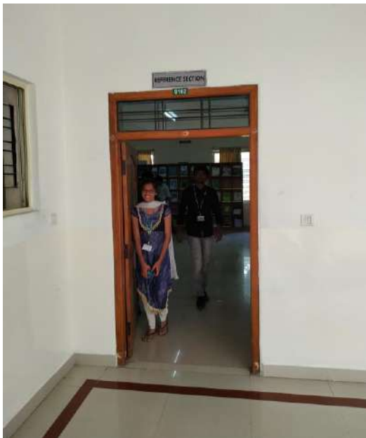
Reference Section Entrance