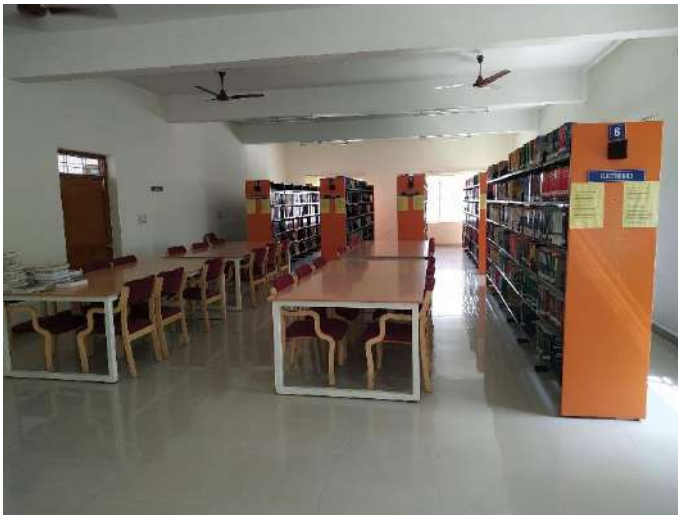
Central Library Side - B