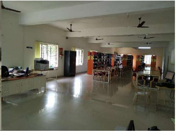
Central Library Side - A