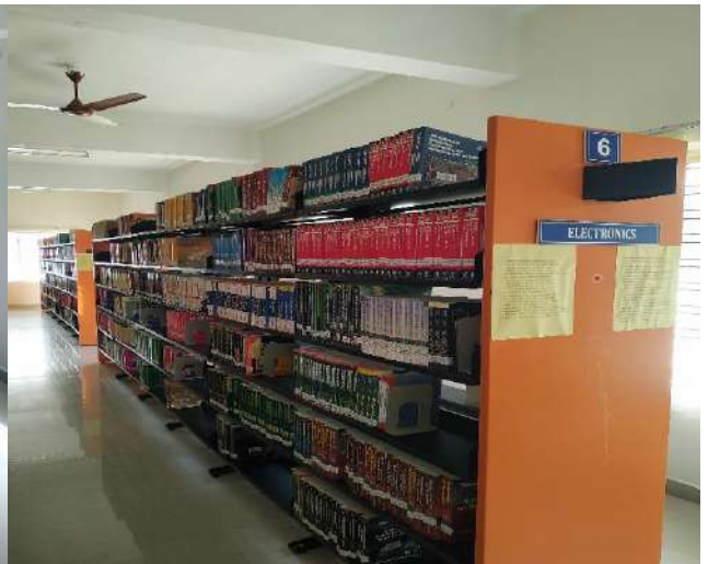
Central Library Book Racks