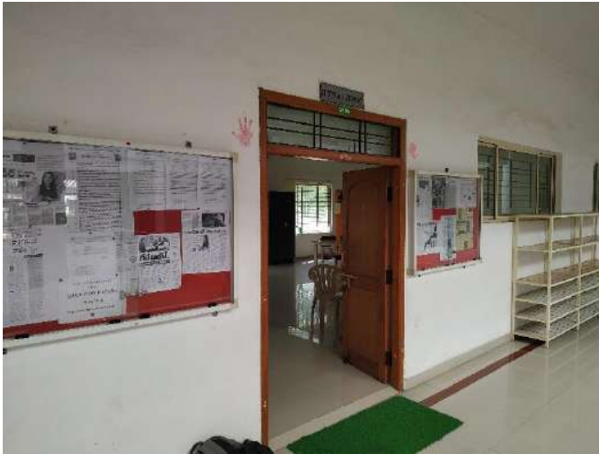
Central Library Entrance